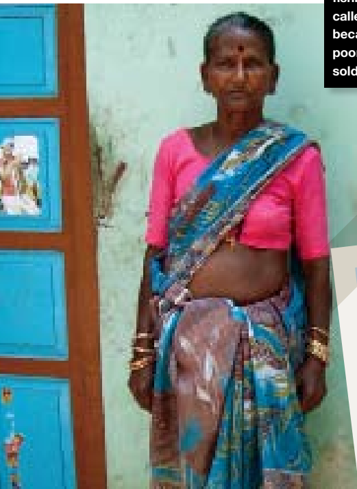
Villivakkam Chennai used to be known as a fishing town; now it's called "Kidney Village" because many of its poorest residents have sold their kidneys.