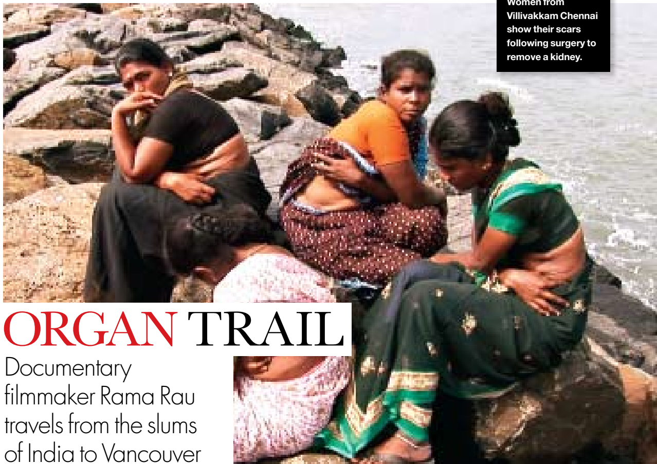
Women from Villivakkam Chennai show their scars following surgery to remove a kidney.